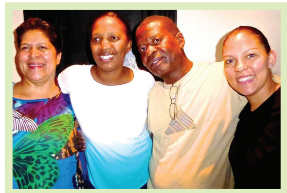
WorkQ® and LeadQ® unfold in Kiptown, an historic district of Soweto, as employees and leaders begin their engagement journey.