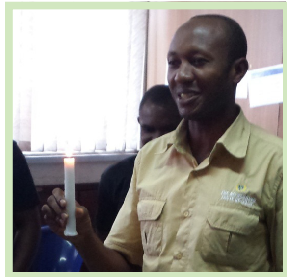
Through WorkQ® PABOD was able to realign employees with the organisation's vision and inspire them to care more deeply.